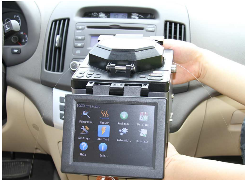
Car lighter socket can be utilized for fusion splicing.