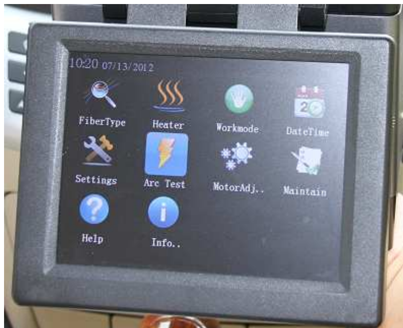
Brand new GUI graphic interface and touch screen design