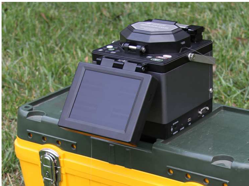
Carrying case can be used as work bench.